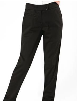
Bootcut or Slim Fit Formal Style are a good choice