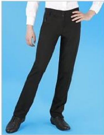
Bootleg or Slim leg are both good choices