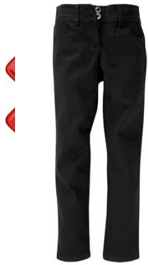
Skinny Jeans style trousers are not suitable